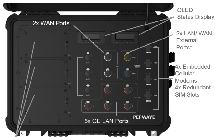
Slot 1/2/3 Port Patch